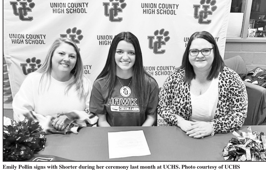
going to cheer for football and

competition side of it. NGN: For now, are you to major in?