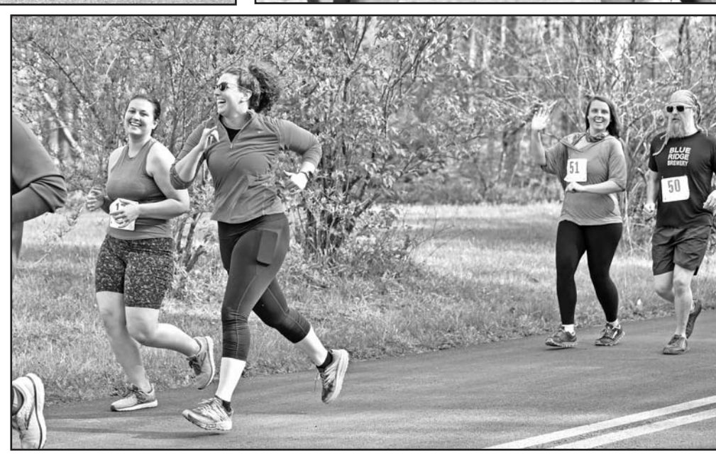
Despite the challenging course facing the participants, runners of all ages and skill levels couldn't wait to return to the scenic sights, sounds and smiles that have become a staple of Suches' annual Run Above the Clouds 10K and 5k races.