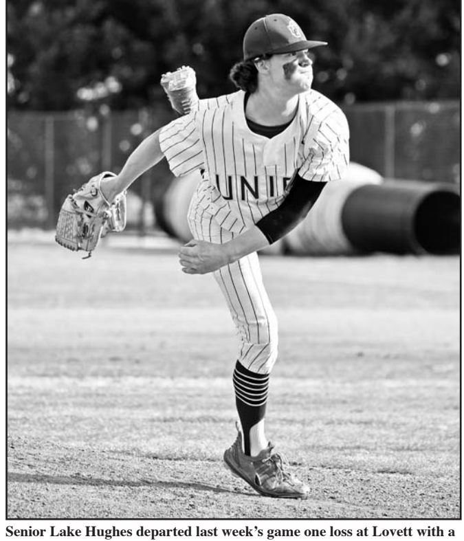
4-3 lead following a 108-pitch outing. base passed ball allowed Lovett 2 hitter.

After a first-pitch strike on the ensuing batter, a two-